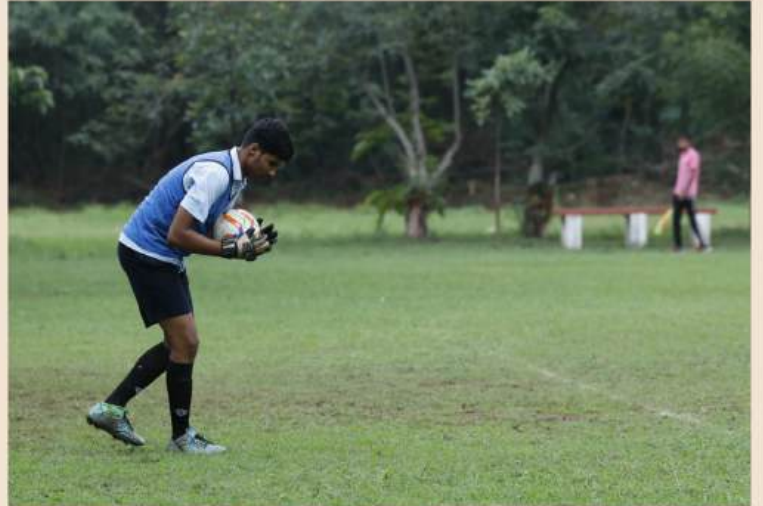
Calm In Chaos