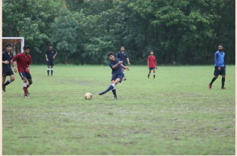
Finish the Fight