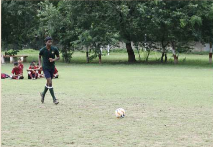
Nerves of Steel