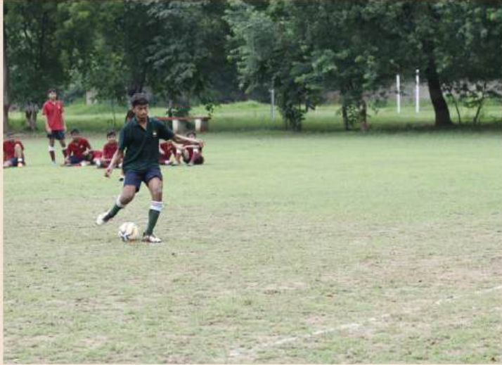
One Shot, One Goal