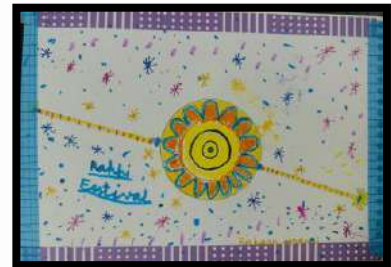
Rishaan Agrawal Class I B