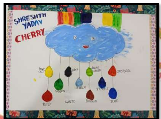
Shreshth Yadav Cherry