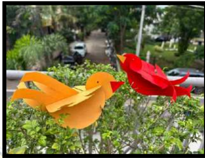
Seerat Bahal Class I A