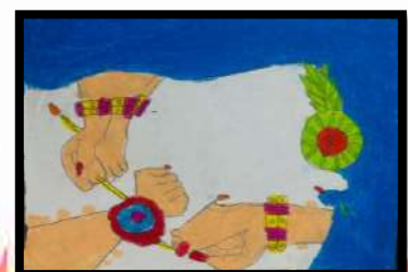
Ira Bajaj Class I B