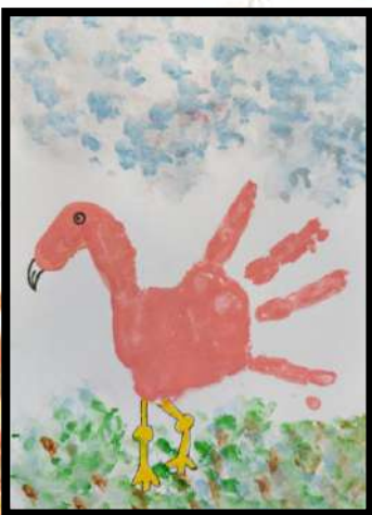
Vanshil Agrawal Nursery