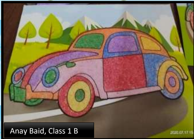
Anay Baid, Class 1 B