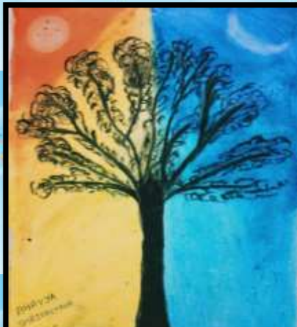
Bhavya Shrivastava, Class 3 F