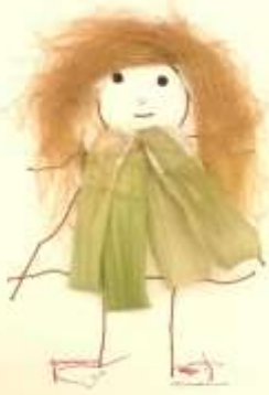
Amaira Tiwari, Blueberry