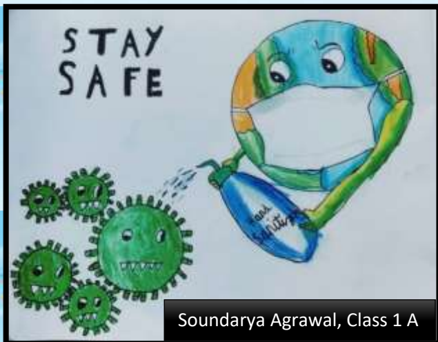
Soundarya Agrawal, Class 1 A