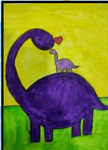
Arnav Agrawal, KG 2 B