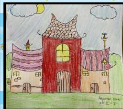
Aayansh Nihal, KG 2 E