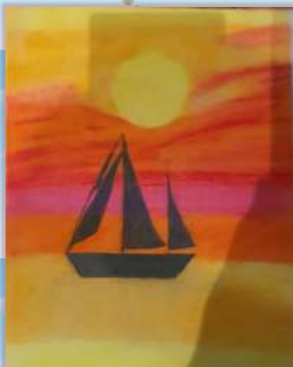
Anushka Arora, Class 5 G