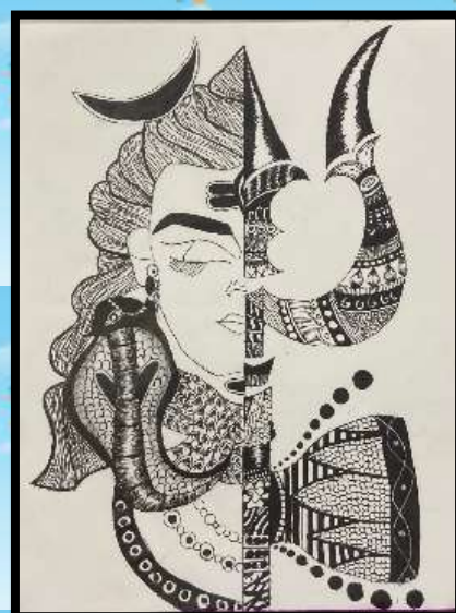
Shatakshi Kakkar, Class 5 F