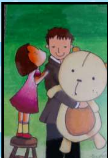
Aarushi Agrawal, Class 5 D