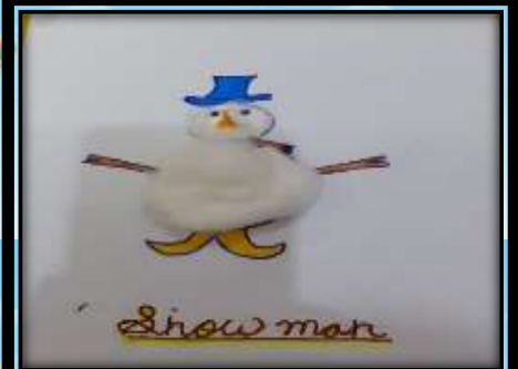
Rudraksh Gautam, Class 1 A