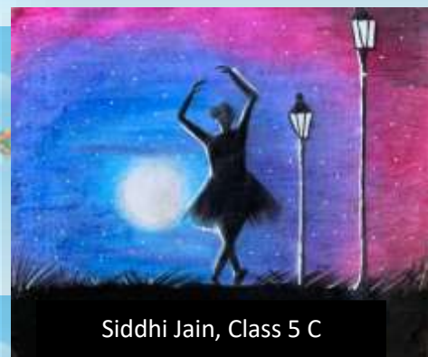
Siddhi Jain, Class 5 C