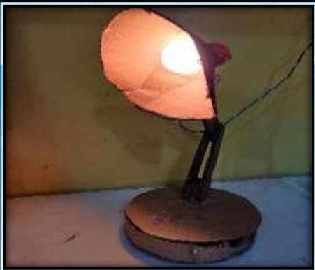
Aarvi Agrawal, Class 5 B