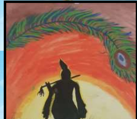
Dhriti Goenka, Class 4 A