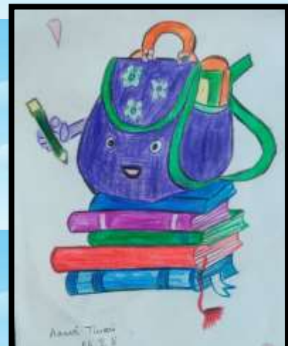
Aarvi Tiwari, KG 2 E