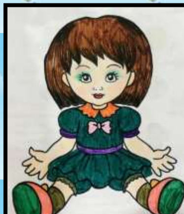
Tejasvi Mishra, Class 2 D