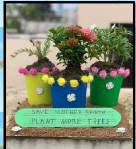
Anaysha Agrawal, KG 1 C