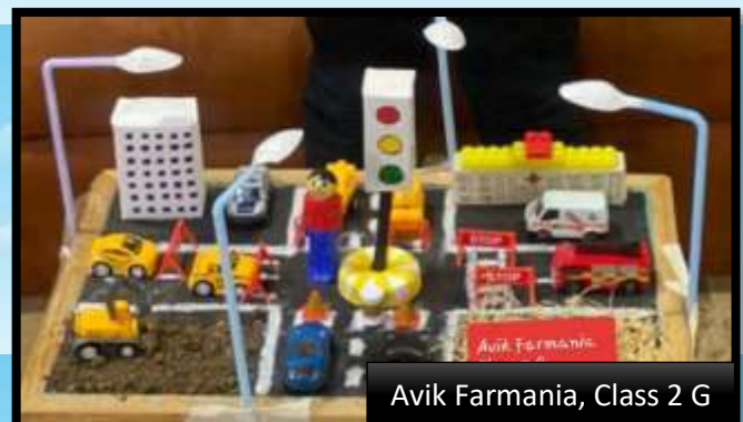
Avik Farmania, Class 2 G