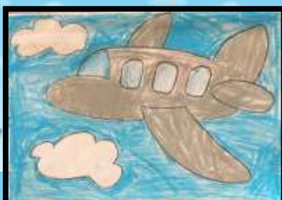
Vivaan Agrawal, Class 2 D