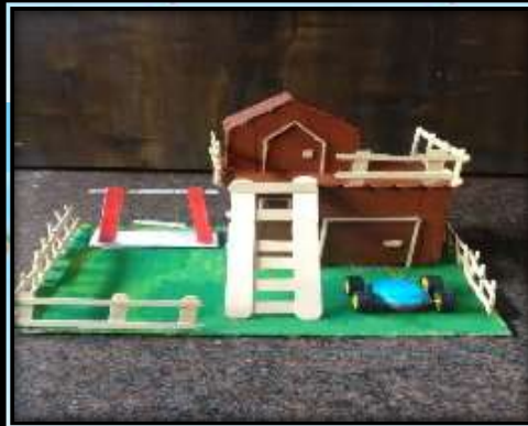
Aditi Agrawal, Class 5 F