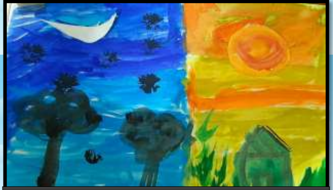
Rajveer Kushwaha, KG 1 D