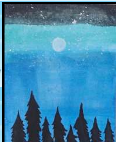
Veer Singh Sando, Class 5 E