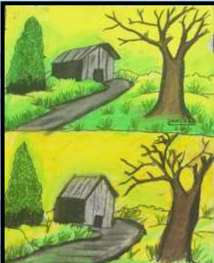
Saachee Kankariya, Class 2 G