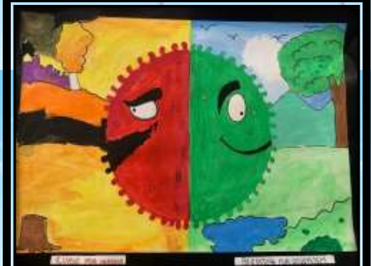
Krishika Agrawal, Class 1 B