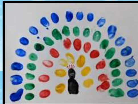
Moksh Batavia, Nursery