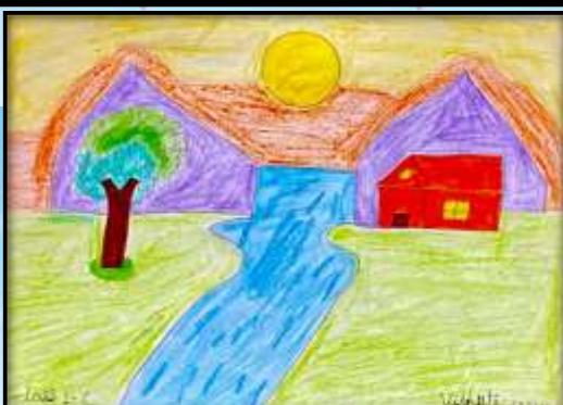
Vibhuti Verma, Class 1 C