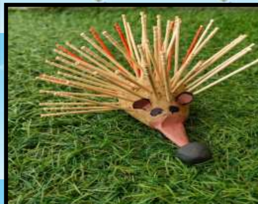
Rannvijay Pinjani, KG 1 A