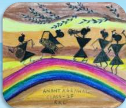
Anant Agrawal, Class 2 F