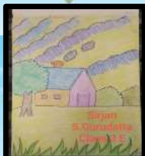
Srijan S Gurudatta Class 3 E