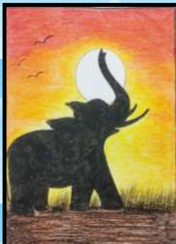
Debanshi Bhoi, Class 4 F