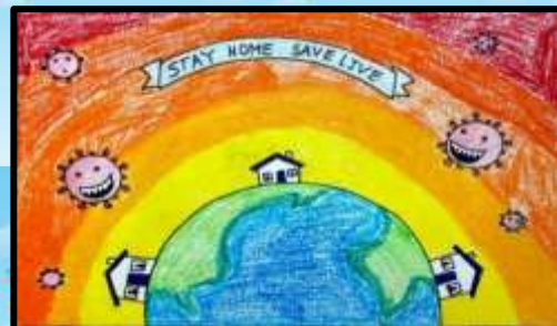
Shivesh Agrawal, Class 2 D