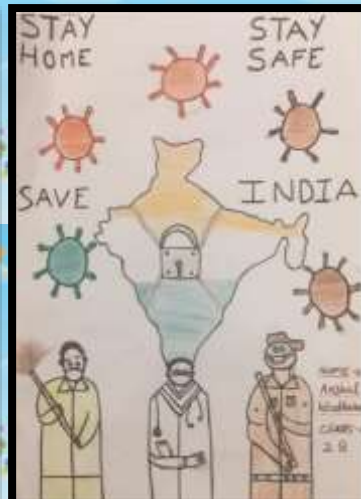
Anshul Wadhwani, Class 2 B