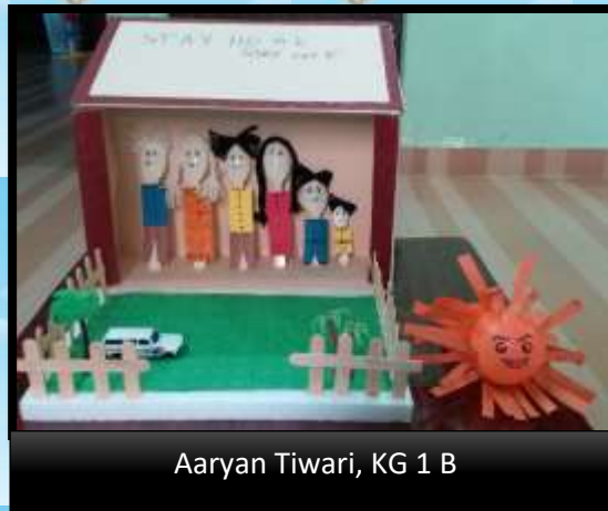
Aaryan Tiwari, KG 1 B