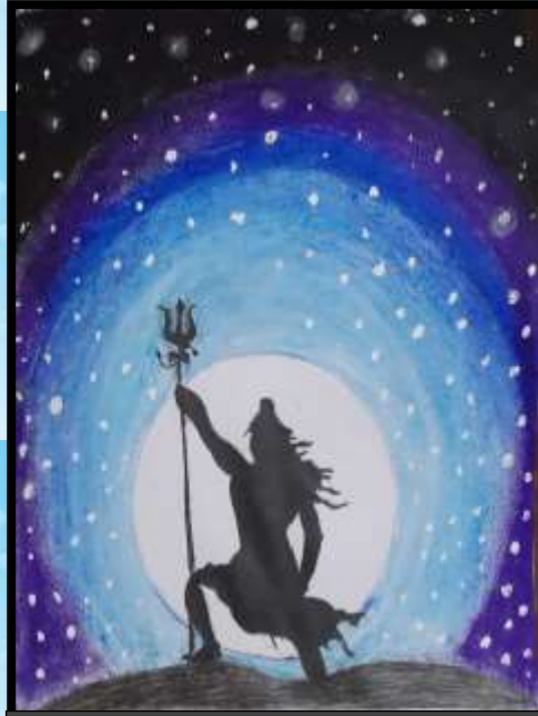
Chaitanya Modak, 5 B