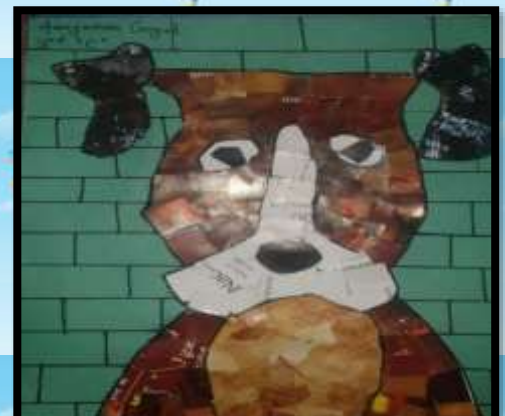
Aaryaman Goyal, Class 3 C