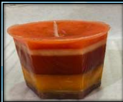
Vedant Singh, KG 2 D