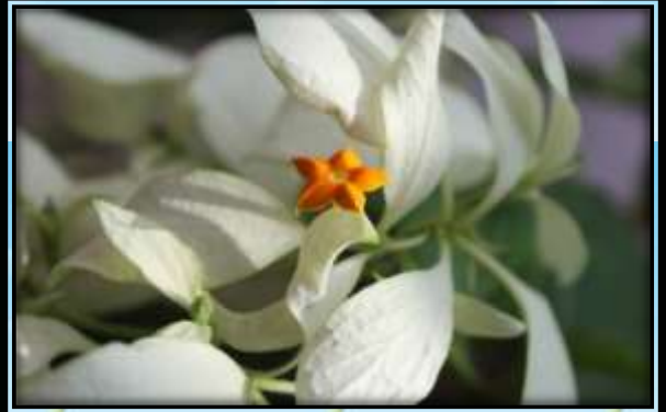
Anas Ullah, Class 5 D