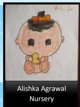
Alishka Agrawal Nursery