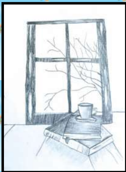
Arham Jain, Class 5 C