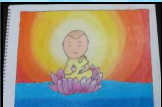
Aarav Agrawal, Class 1 B