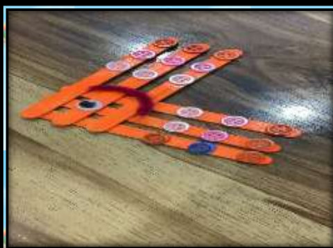
Nitara Goyal, Nursery