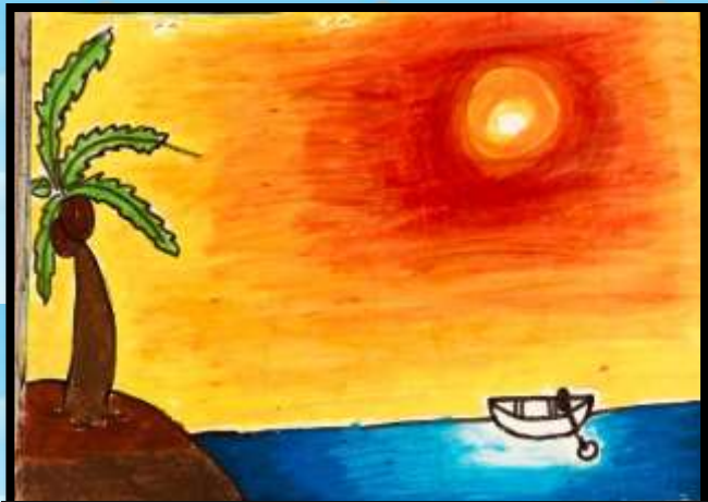
Dhara Jain, Class 1 F