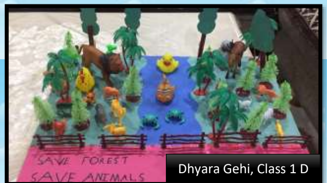
Dhyara Gehi, Class 1 D