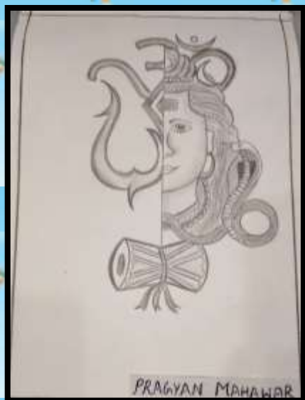
Pragyan Mahawar, Class 5 D