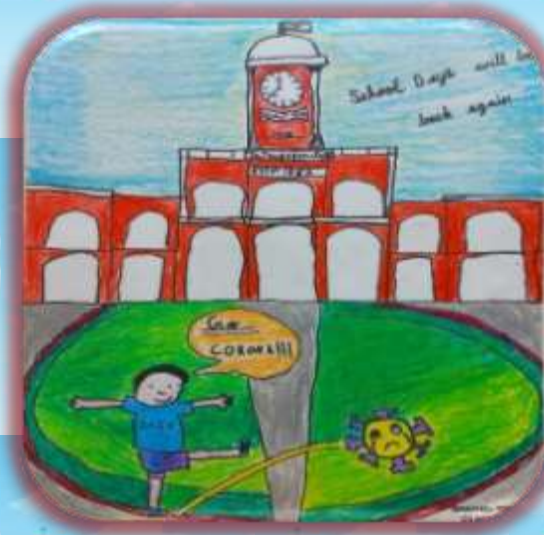
Saransh Jhabak, Class 2 B