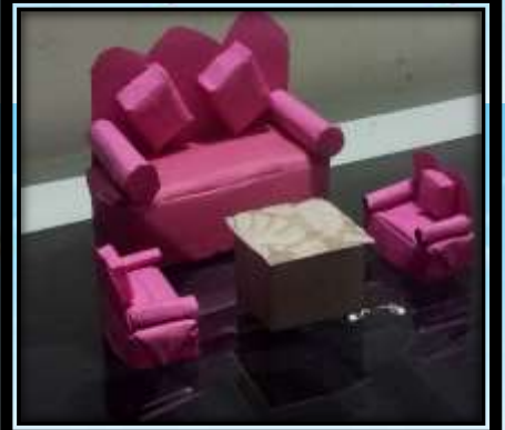
Shivam Agrawal, Class 5 F