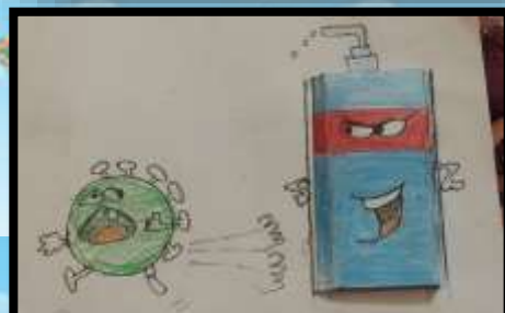
Dhanisha Parwani, KG 2 B